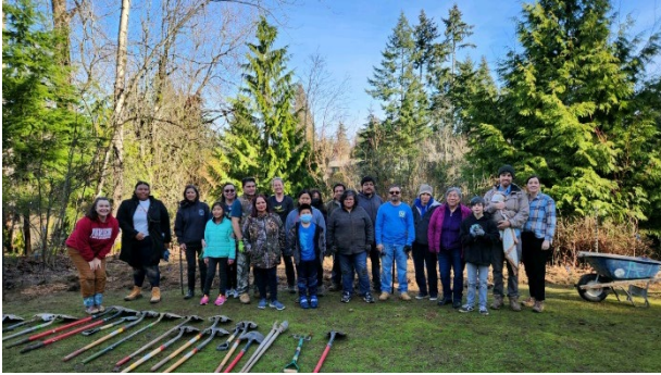
Participants at a restoration event.

The Green Burien Partnership 's vision is to have a healthy urban forest supporting — and supported by — an aware and engaged community. The Green Burien Partnership's mission is to engage the community in enhancing and maintaining a healthy, sustainable urban forest in order to increase quality of life, mitigate climate change at the local level, and protect Burien's valuable natural resources for current and future generations to enjoy. The Green Burien Partnership leads with environmental justice with the understanding that it's our responsibility to shift the story around access to green spaces while we improve them. It is through relationship building and partnership that this work is possible. This work is guided by the Green Burien Partnership Urban Forest Stewardship Plan .