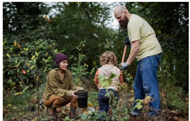
EarthCorps staff member planting a Douglas-fir tree with two volunteers at Green Burien Day at Hilltop Park.