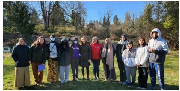
Green Teen participants participate in a Department of Natural Resources press conference with Burien Mayor Sofia Aragon and Commissioner of Public Lands Hilary Franz at Hilltop Park.